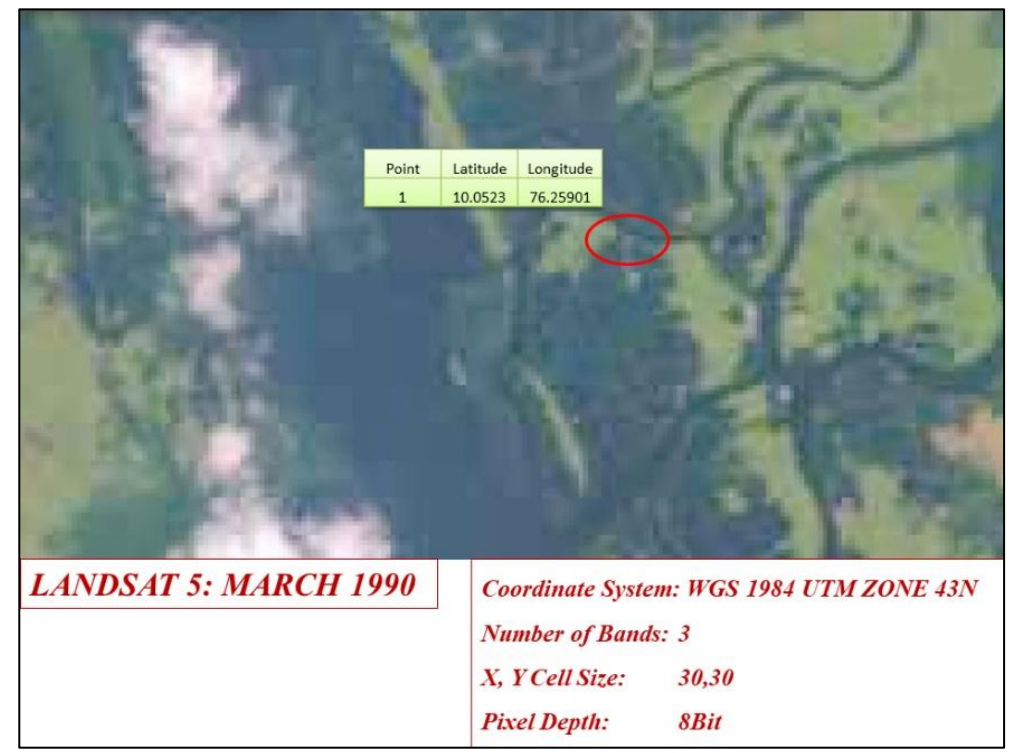
Figure 2: LANDSAT Satellite imagery of 1990 showing the existence of bund/ sluice gate structure.