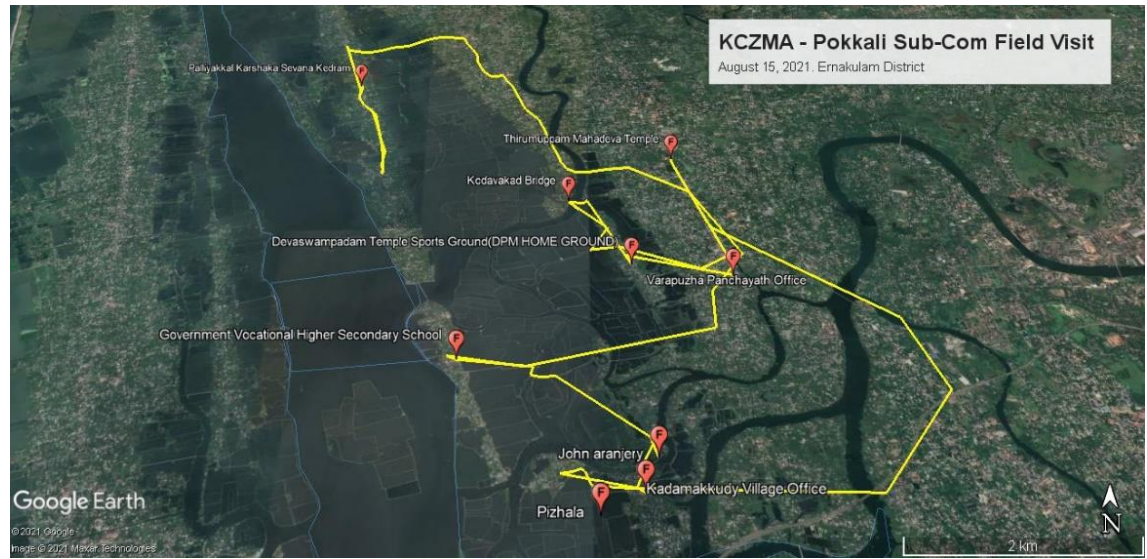
Figure 4: Areas covered during field visit to pokkali wetland areas, Ernakulam district (Aug. 2021)

We can only describe the condition of almost all the dwellings we saw as unliveable and unsafe (Fig. 2, 3). Many are in unsafe and dilapidated condition. There are several cases where permissions under government housing schemes have been held up due to the ineligibility to get CRZ clearance. Some of the plots have backwater on more than one side and it is impossible to build any dwelling strictly in conformity with the CRZ norms due to the inability to provide prescribed setback from the HTL. There are many dwellings within close proximity to backwaters, road on the other side and the total width of land area is just 100 to 200 meters on either side. A few of the current occupiers do not seem to have clear ownership title to the land.