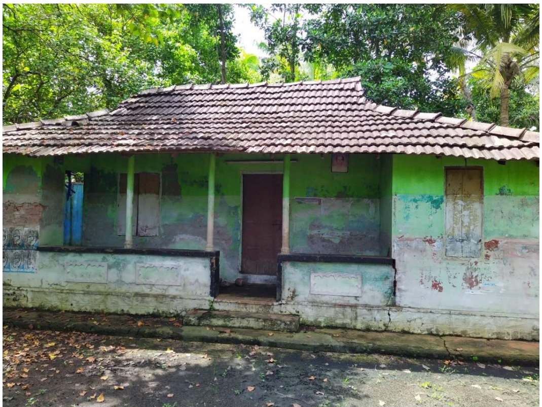
Figure 6: A house in dilapidated condition. Mark of the 2018 flood level can also be seen.

We undertook a quick compilation of the CRZ clearance applications related to dwellings from pokkali areas that had been discussed by KCZMA directly or in the DLC minutes presented to KCZMA members. The data is compiled from all the available applications and can be considered reasonably representative. The summary of the averages obtained from the data and the number of applications relevant (N) are presented in Table-1.