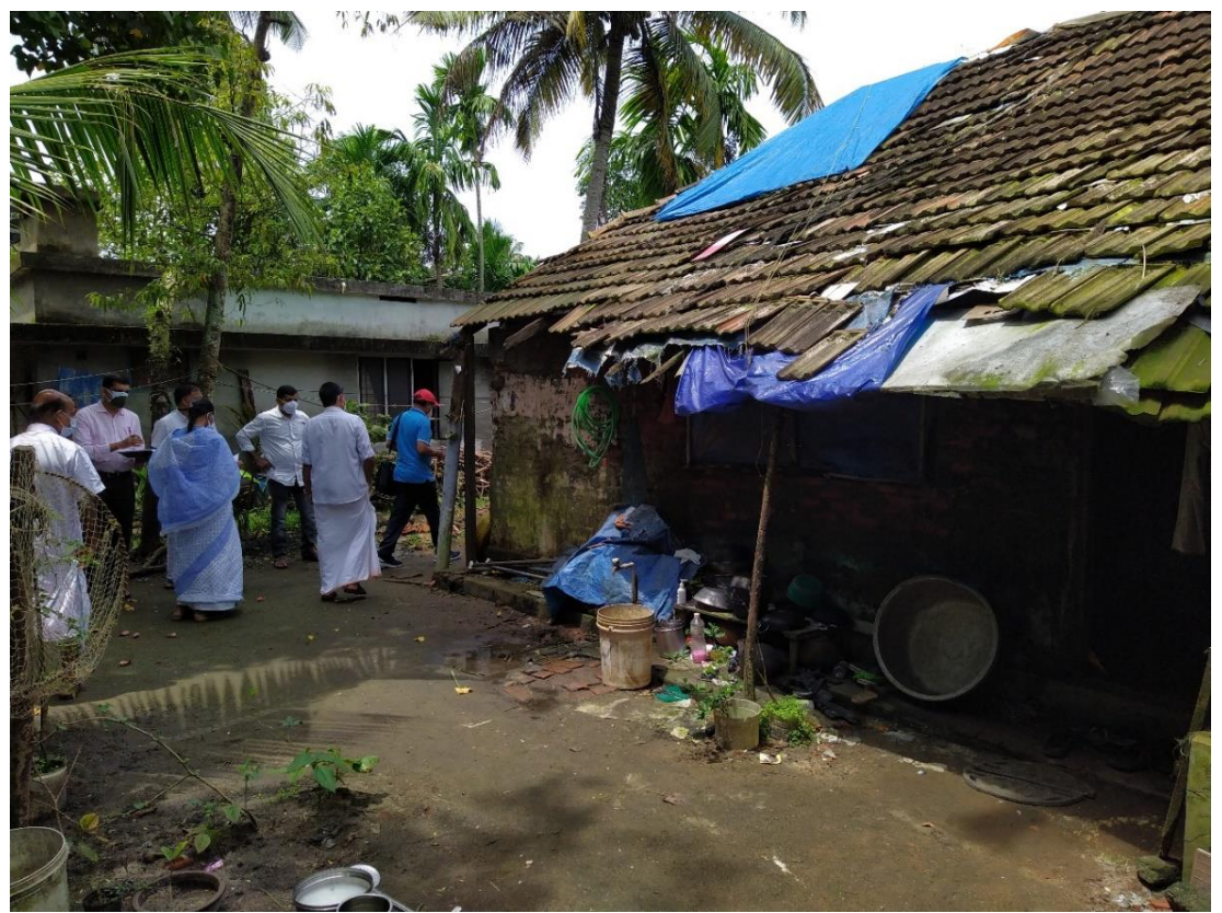
Figure 5: A small dwelling unable to get the benefit of govt. housing scheme

We can only describe the condition of almost all the dwellings we saw as unliveable and unsafe (Fig. 2, 3). Many are in unsafe and dilapidated condition. There are several cases where permissions under government housing schemes have been held up due to the ineligibility to get CRZ clearance. Some of the plots have backwater on more than one side and it is impossible to build any dwelling strictly in conformity with the CRZ norms due to the inability to provide prescribed setback from the HTL. There are many dwellings within close proximity to backwaters, road on the other side and the total width of land area is just 100 to 200 meters on either side. A few of the current occupiers do not seem to have clear ownership title to the land.