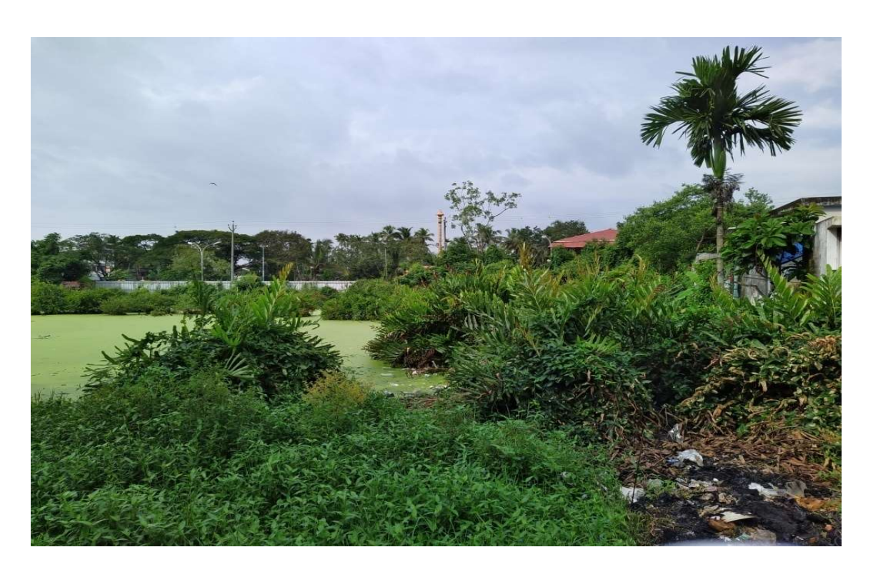
Plate-7: Mangrove area at Edakochi (Location: 76° 17' 23.09" E 9° 54' 50.65" N Cochin Municipal Corporation, Village: Edakochi)