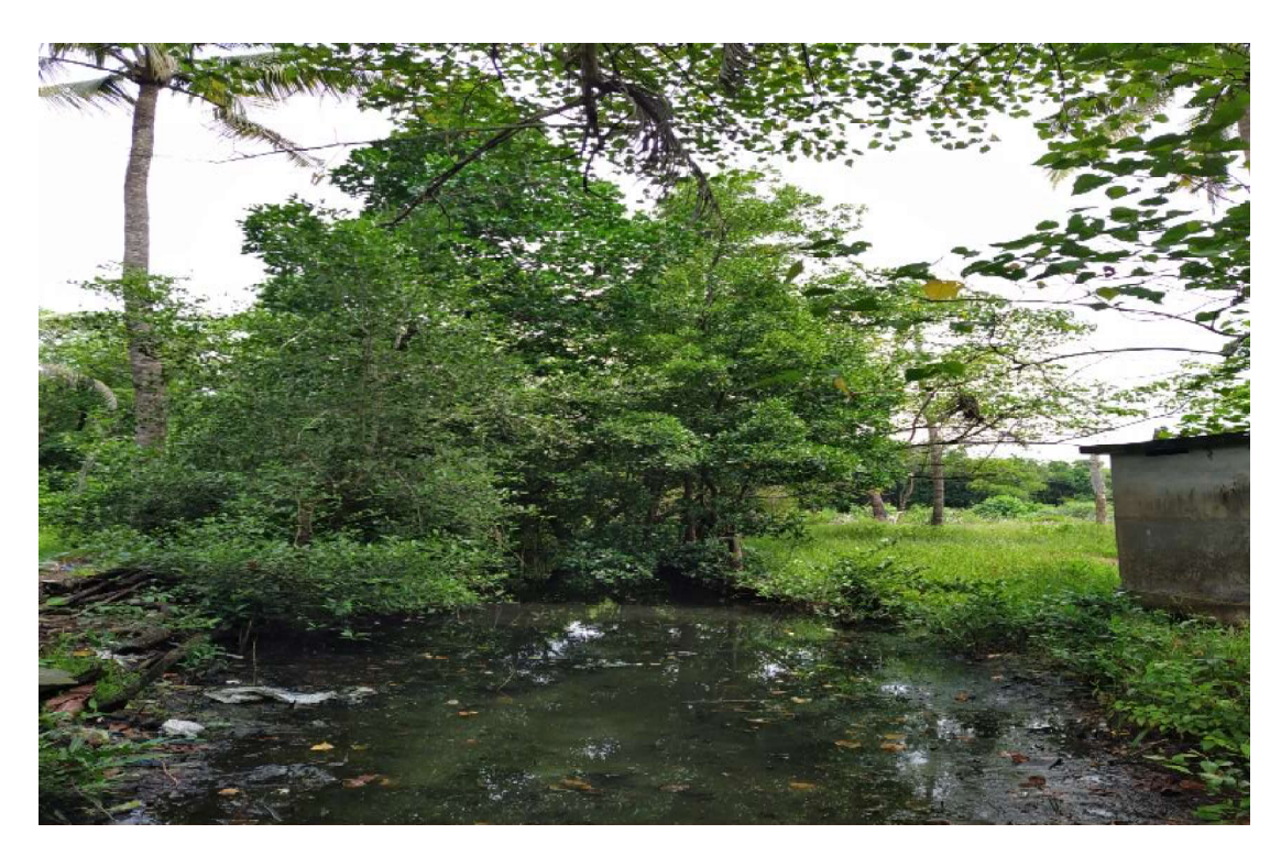
Plate-6: Mangrove area at Puthuvype (Location: 76° 13' 42.18" E 9° 59' 36.65" N, Elamkunnapuzha Panchayat, Village: Elamkunnapuzha)