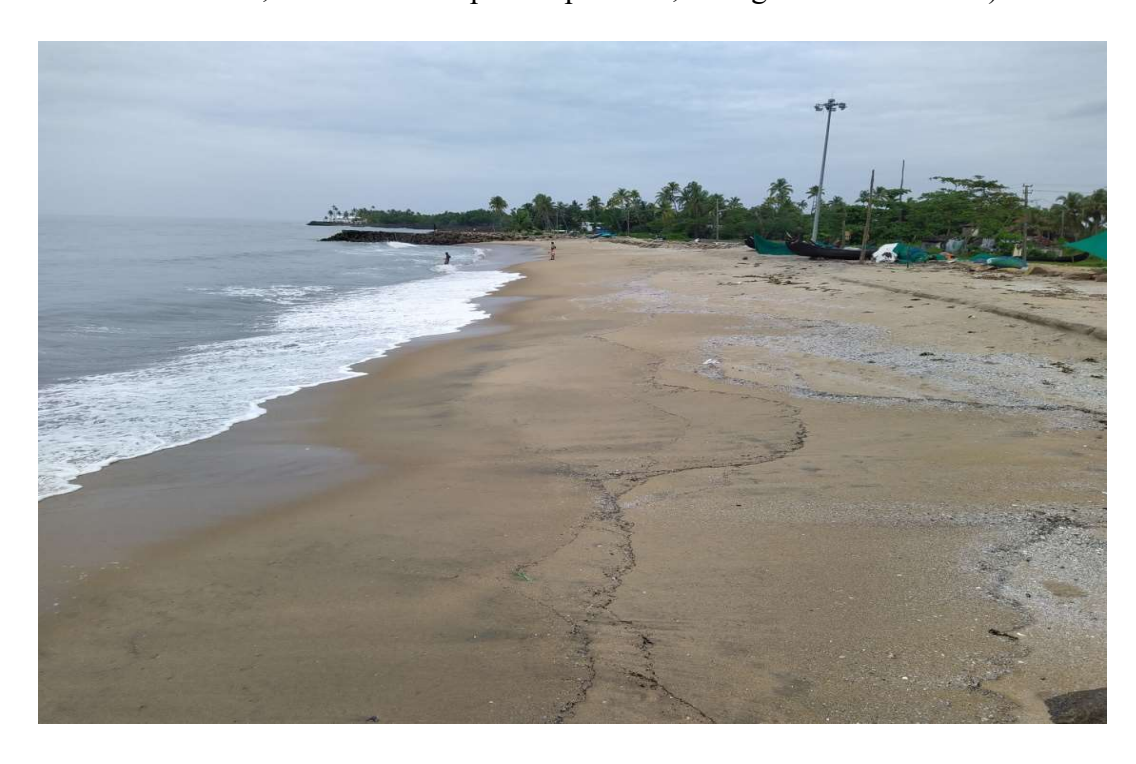
Plate-2: HTL at Njarakkal beach (Location: 76° 12' 19.31" E 10° 2' 51.94" N, Nayarambalam Panchayat, Village: Nayarambalam)