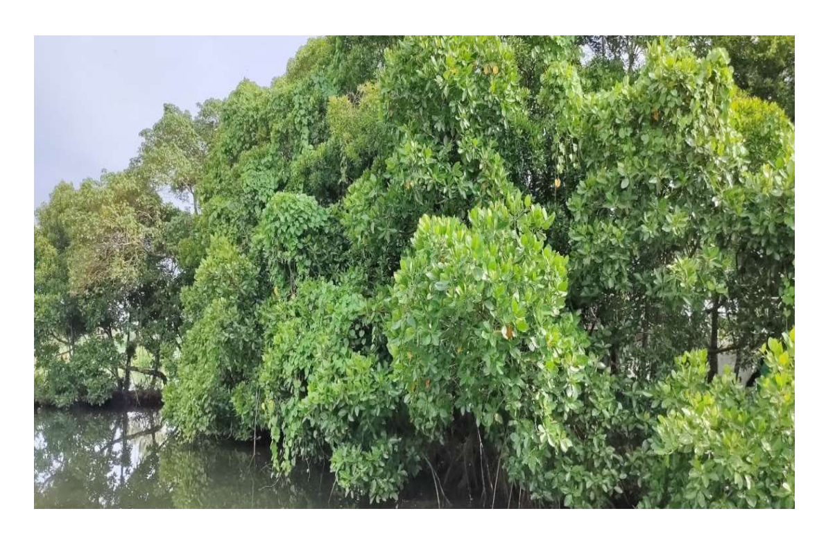
Plate-3: Mangrove area at Netoor, (Location: 76° 20' 40.01" E 9° 55' 47.62" N, Thrippunithura, Village: Thekkumbhagam)