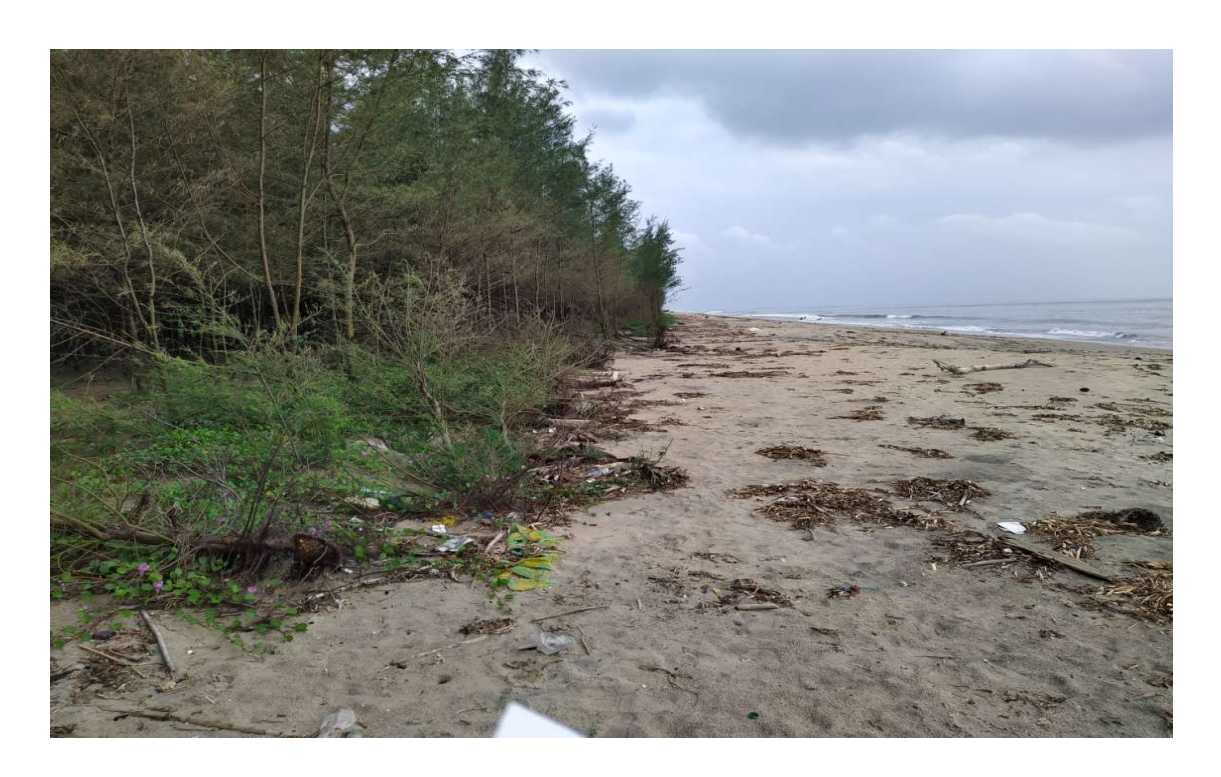
Plate-9: HTL at Elamkunnapuzha Blue waves beach (Location: 76° 12' 42.84" E 10° 1' 31.85" N, Elamkunnapuzha Panchayat, Village: Elamkunnapuzha)