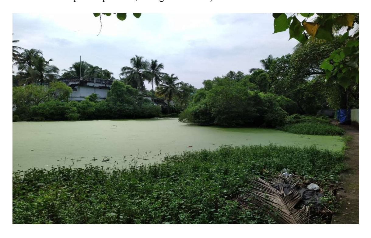
Plate-8: Mangrove area at Edakochi (Location: 76° 17' 25.67" E 9° 54' 53.95" N, Cochin Municipal Corporation, Village: Edakochi)