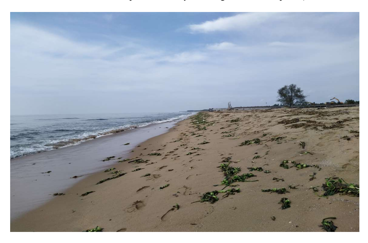
Plate 10: HTL at Puthuvype beach (Location: 76° 13' 8.54" E 9° 59' 55.68" N Elamkunnapuzha Panchayat, Village: Elamkunnapuzha)