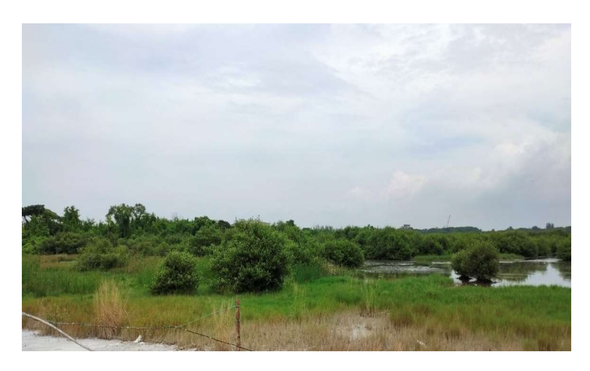
Plate-1: Mangrove area at Willingdon Island (Location: 76° 16' 48.88" E 9° 55' 50.99" N, Cochin Municipal Corporation, Village: Rameshwaram)