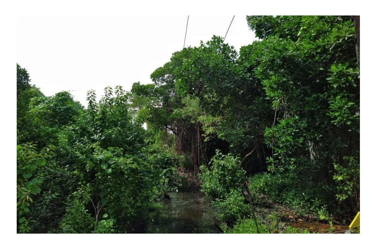
Plate-5: Mangrove area at Valappu (Location: 76° 13' 40.60" E 10° 0' 26.05" N Elamkunnapuzha, Village: Elamkunnapuzha.